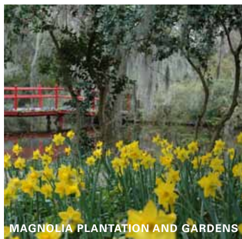
MAGNOLIA PLANTATION AND GARDENS

modes of transportation available including: bus, trolley, horse and carriage or, because the hotel is so close to everything, you can walk. This is your day to choose what you want to do and when you want to do it.